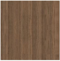
Veneered wood Walnut Canaletto