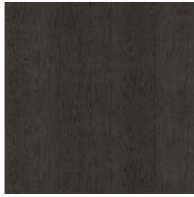
Veneered wood Coal oak