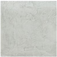
Concrete Travertin look